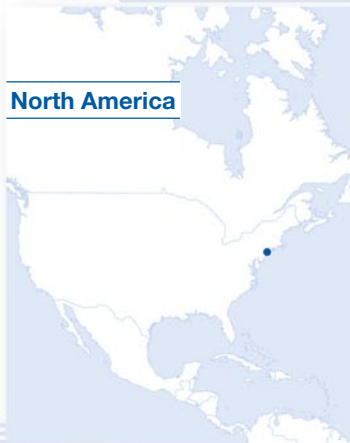
Structured Property Financing